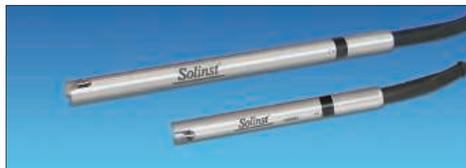
Model 122 P1 and 122M Probes